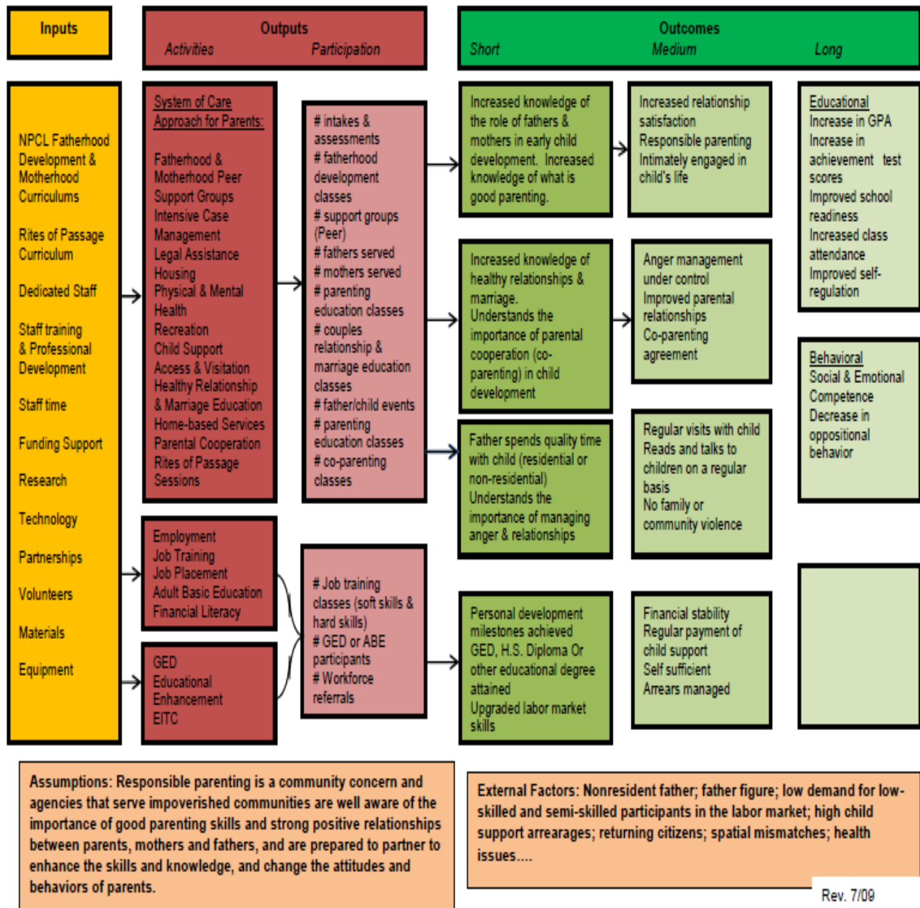
Family Development Initiative: A Logic Model